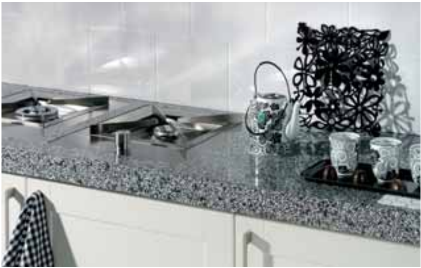
Mosaici Carbone 7150