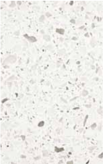
Nougat ● +