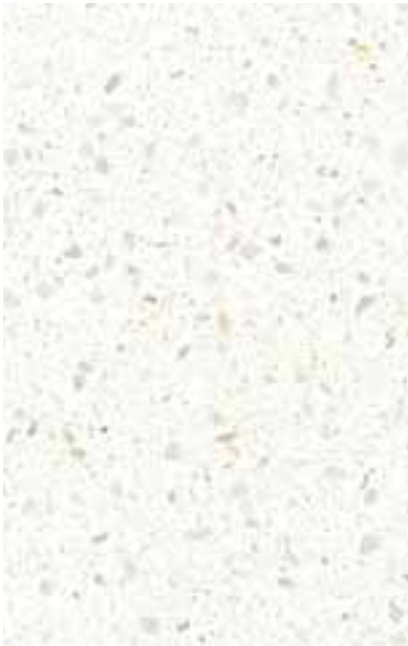
Ice Snow +