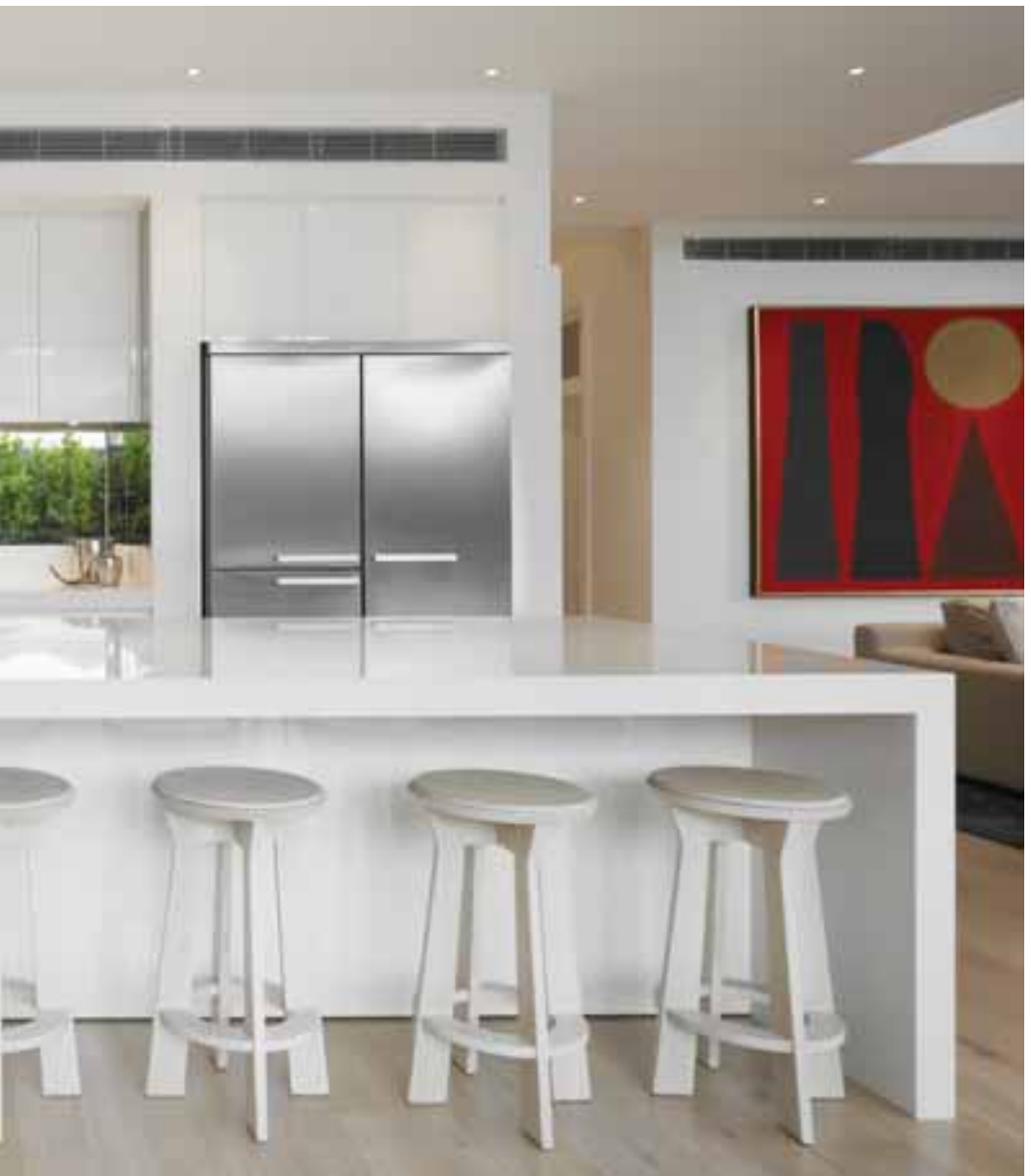
Kitchen by Mim Design

Beauty combined with functionality makes CaesarStone the perfect choice for benchtops, splashbacks, wall panelling and numerous other applications.