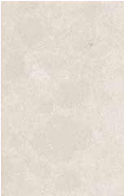
Whisper ● NEW