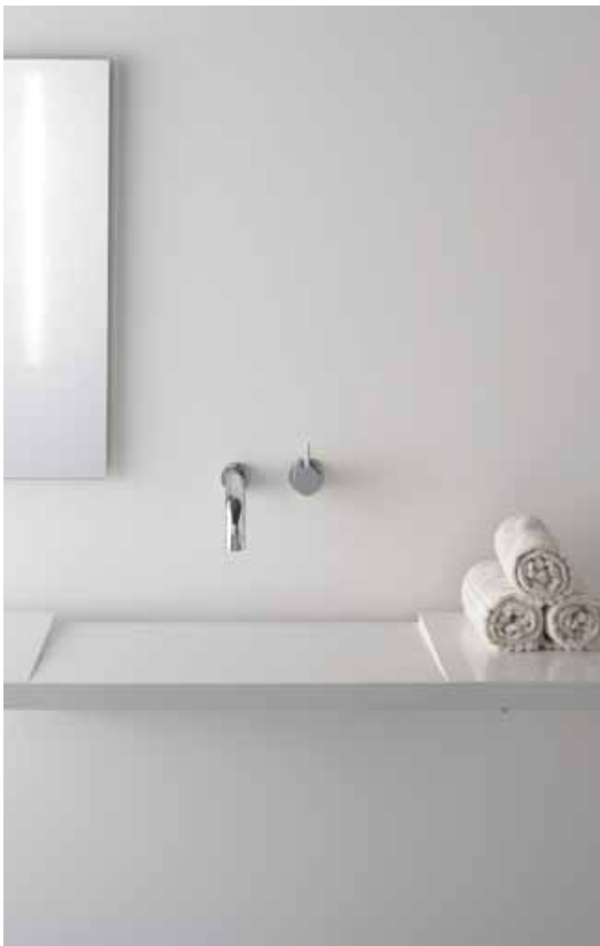
Geo Washplane® by Omvivo and walls in Snow 2141

Non-porous, waterproof, mould and mildew resistant, CaesarStone quartz surfaces are ideal for bathroom applications. Large slabs provide a sleek and modern aesthetic, minimising joins and therefore maintenance.