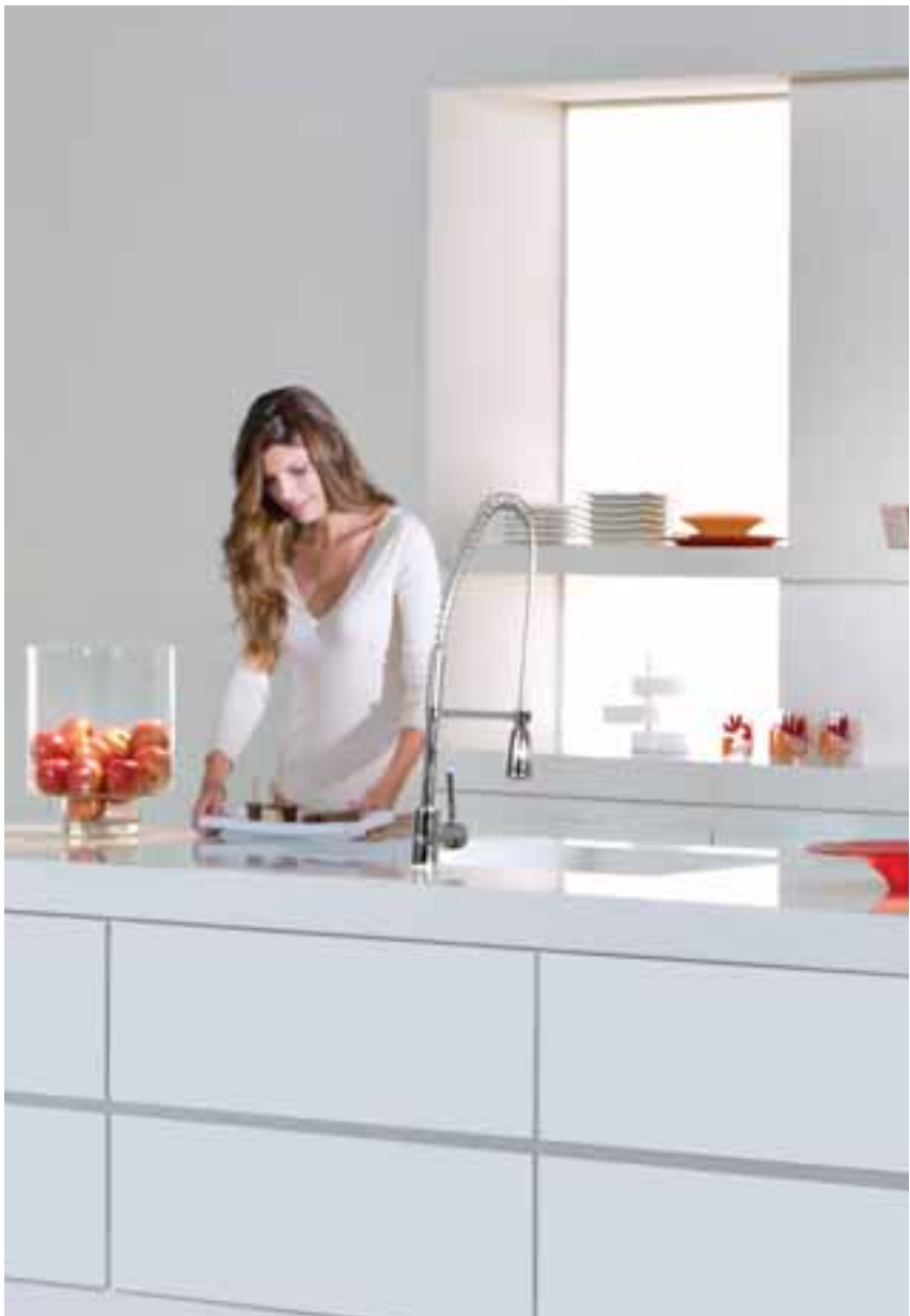
Benchtop and splashback in Snow 2141

Style combined with functionality means CaesarStone surfaces are ideal for numerous applications in residential and commercial environments such as benchtops, splashbacks, wall panelling, custom made furniture and more.