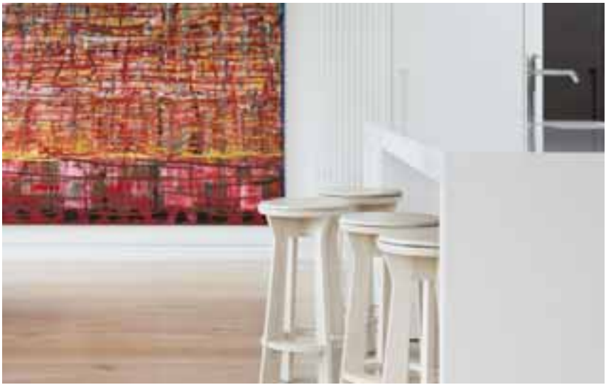
Kitchen benchtop and end panels in Snow 2141