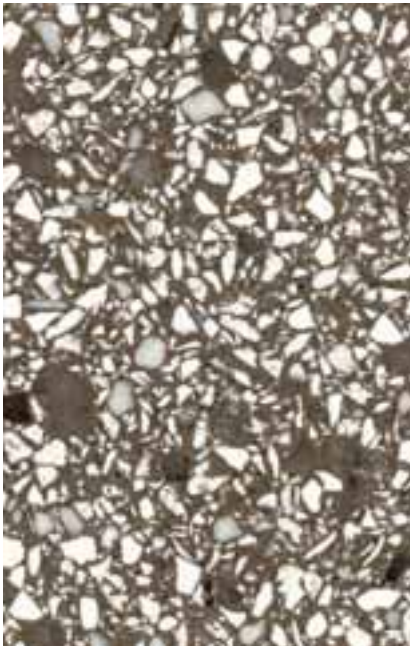
Mosaici Marrone ● ■