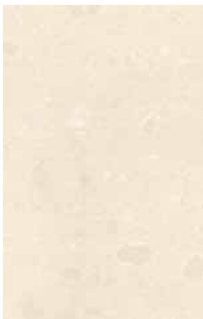
Buttermilk ● NEW