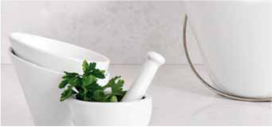
Benchtop & splashback in Organic White 4600

Beauty combined with functionality makes CaesarStone the perfect choice for benchtops, splashbacks, wall panelling and numerous other applications.