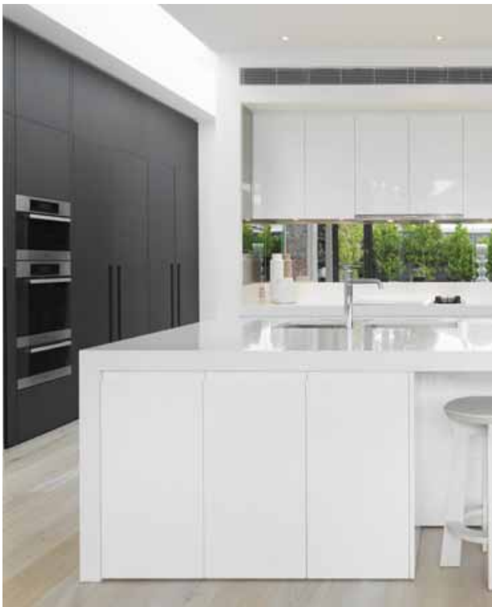
Kitchen island, benchtops and end panels in Snow 2141

An increasingly popular choice for kitchen splashbacks, CaesarStone is a grout free, low maintenance alternative to materials such as tiles and glass. A CaesarStone splashback offers colour continuity from benchtop to splashback and cost effective, same day installation.